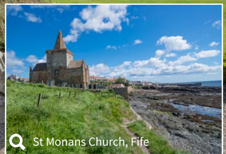
🔍 St Monans Church, Fife