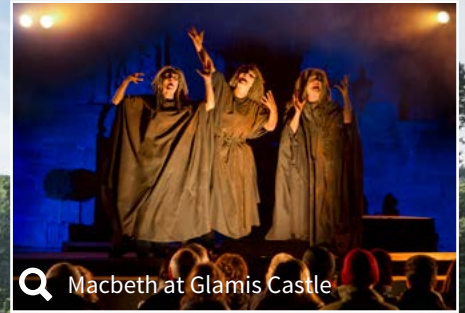
🔍 Macbeth at Glamis Castle