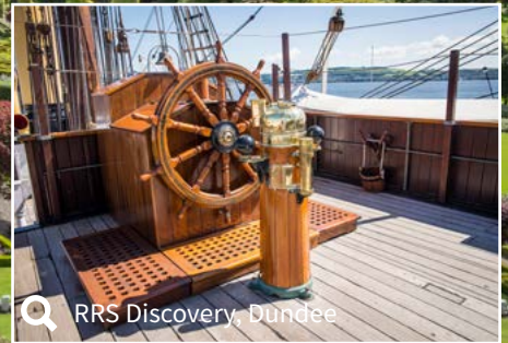
🔍 RRS Discovery, Dundee