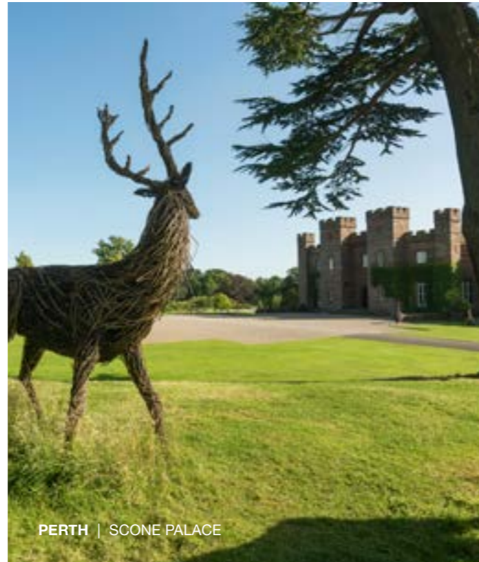
PERTH | SCONE PALACE