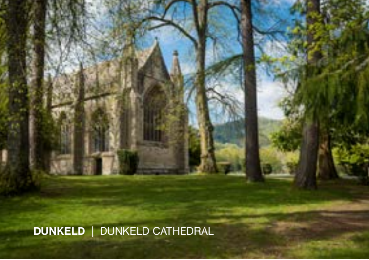
DUNKELD | DUNKELD CATHEDRAL