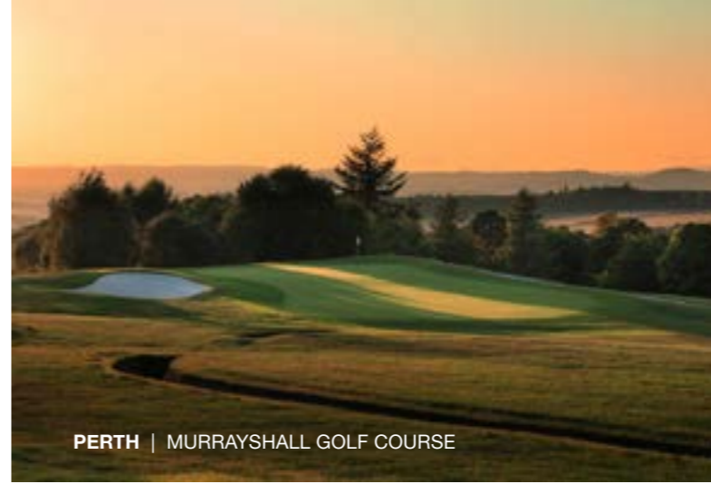
PERTH | MURRAYSHALL GOLF COURSE

There is an impressive range of four-star accommodation in the region and travellers looking for a more central base with a city vibe for their stay might consider Dundee's Apex City Quay Hotel . Situated on the banks of the River Tay, the hotel is within walking distance of the city's spectacular Waterfront Development and boasts facilities including a swimming pool and indulgent spa, perfect for soothing tired post-round muscles and only a stone's throw away from Dundee Airport should you wish to book a fly-drive stay.