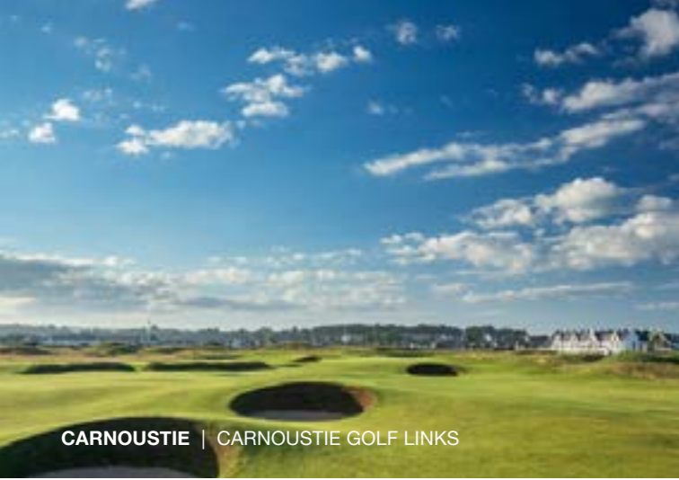
CARNOUSTIE | CARNOUSTIE GOLF LINKS