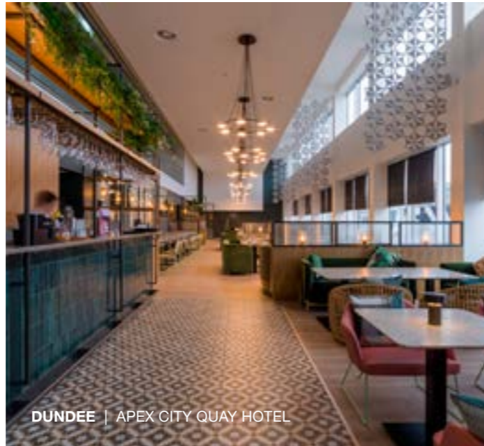
DUNDEE | APEX CITY QUAY HOTEL

Scotland's Tay Country is home to some of the country's finest food and drink producers, and there are a wide range of experiences to enjoy. Lindores Abbey Distillery's Apothecary Experience invites travellers to embark on a 'flavour journey' exploring the five senses and offers the opportunity to create a completely unique spirit to take home with them. A combination of distilling history, combining science and mixology, an experience not to be missed. We would also recommend picking up a bottle of their Aqua Vitae to enjoy at home, a multi award-winning botanical spirit, flavoured with locally grown green herbs, and can be enjoyed as a mixed drink or as a cocktail base.