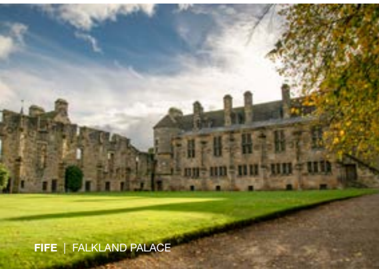
FIFE | FALKLAND PALACE

Only a short drive from the Kingarroch course is Falkland Palace – a stunning Renaissance palace which has played host to some of Scottish history's most recognizable figures. Dating to the 12 th century, and a favourite country residence of Mary Queen of Scots, the palace has the world's oldest tennis courts and is rumoured to have its own Grey Lady who haunts the Tapestry Gallery.